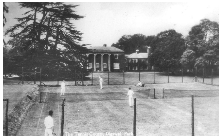
Digswell House with Cedar, Tennis Court and Conservatory.