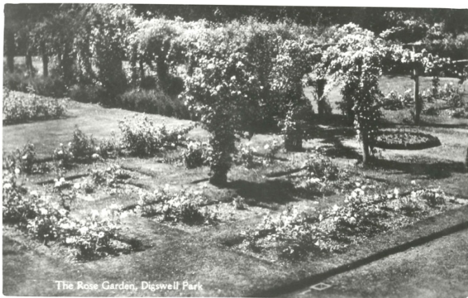
Black and white photograph of The Rose Garden