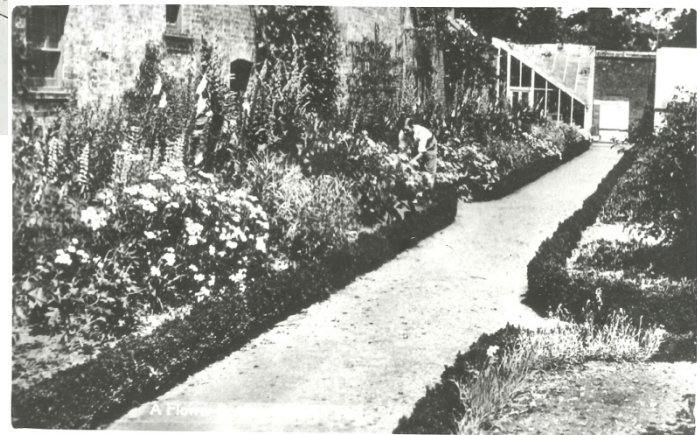
Black and white photograph of a flower border, Digswell Park.