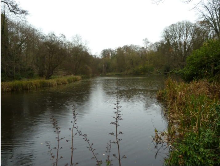
Lake discharging over weir into river Mimram

Digswell lake was completed in 1810 and provided a fine view with its ornamental planting, for those approaching Digswell House across the valley. Although it discharges into the Mimram just upstream of the viaduct, it was not connected to the river at the upstream end, and is spring-fed. Views from the ornamental parkland down to the water were enhanced with planting, much of which remains.