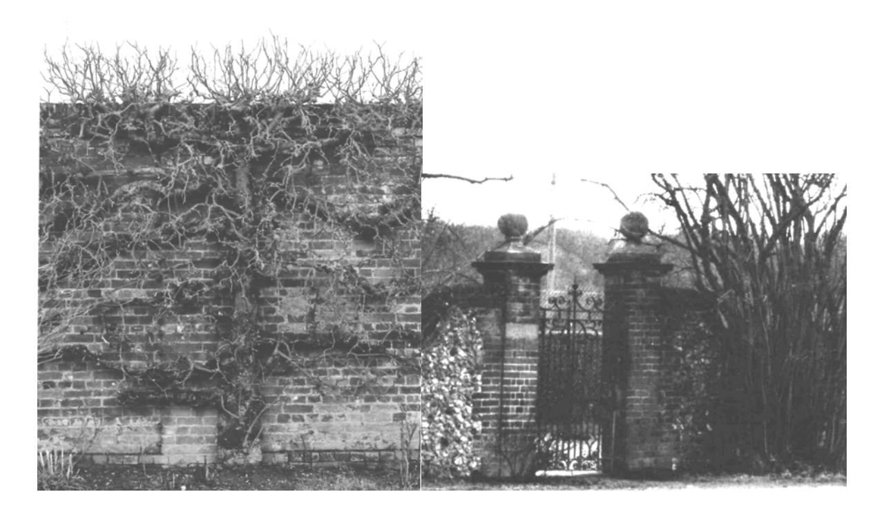
Walled garden at Gaddesden Hoo showing espaliered fruit tree and ornamental gateway

Site visited by: Hertfordshire Gardens Trust Date : December 2008