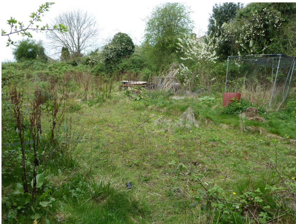
Neglect arising from lack of use 2014