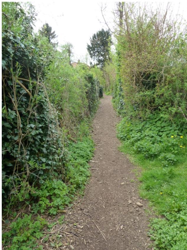
Path between hedged gardens. Gaping Lane Detached Gardens 2014