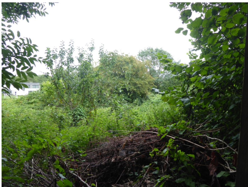
Apple Trees in former hedged Garden 2017