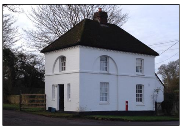
J. Hoo Farm Lodge on Codicote Road

Hoo Farm comes into view across the fields ahead, with a three-acre walled kitchen garden ( H ). As the drive approaches the junction with the road, there is a distinctive white lodge house beside the drive ( J ), with cornice detail and round arched recesses. Turn right and follow the road past a pond on the left, controlled by a sluice gate at the bridge. Along the road on the right are the remnants of the flint and brick boundary walls of The Hoo. The platform of the former mansion may be glimpsed through the trees ( F ).