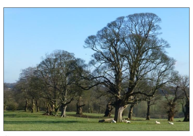
G. Seventeenth century avenue of sweet chestnuts

At a junction keep left, downhill; the right fork leads to the site of the former mansion, which has been replaced by executive houses. Only the stable block ( F ) designed by Sir William Chambers is left standing. A diffuse line of sweet chestnut trees ahead marks the course of a seventeenth century avenue ( G ) pre-dating Brown's landscaping and shown on an early eighteenth century estate map ( N ). Out of sight on the lower slopes near to the site of the former lake, an ice house was built during the eighteenth century.