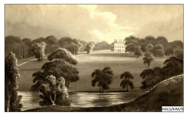
B. The Hoo and widened river Mimram (anon.)

Start northwards on the footpath that extends from the end of Church Lane via an alley and passes Parkfield Sports Ground car park (C) and skirts a wood on the left. After fields open on either side, turn right towards the solitary house. Cross the Hitchin Road (B651), bearing slightly right, to where a footpath leads off. Follow the hedge line and on a left bend turn right across the field to a small copse (D) and then immediately left across the same field to regain the hedge line, now running eastwards. At Hoo Park Cottage (dated 1902) (E), turn left onto the drive under a canopy of trees and pass a cricket pavilion (right).