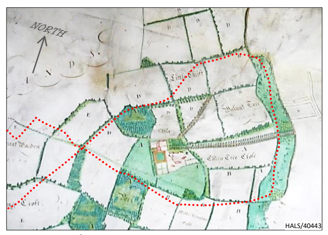
N. Early 18th century Hoo Estate map (walk in red)

Turn round and take in the long views, before skirting the wood, where there is a seat. Across fields to the right are the stables and the site of the mansion, now built over with modern housing ( F ).