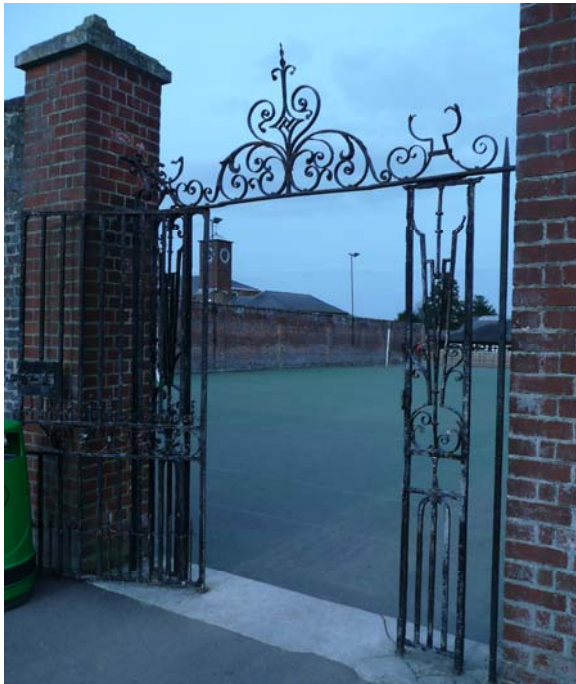
Gates to south of the walled garden showing Sundial removed from its original position damaged ironwork