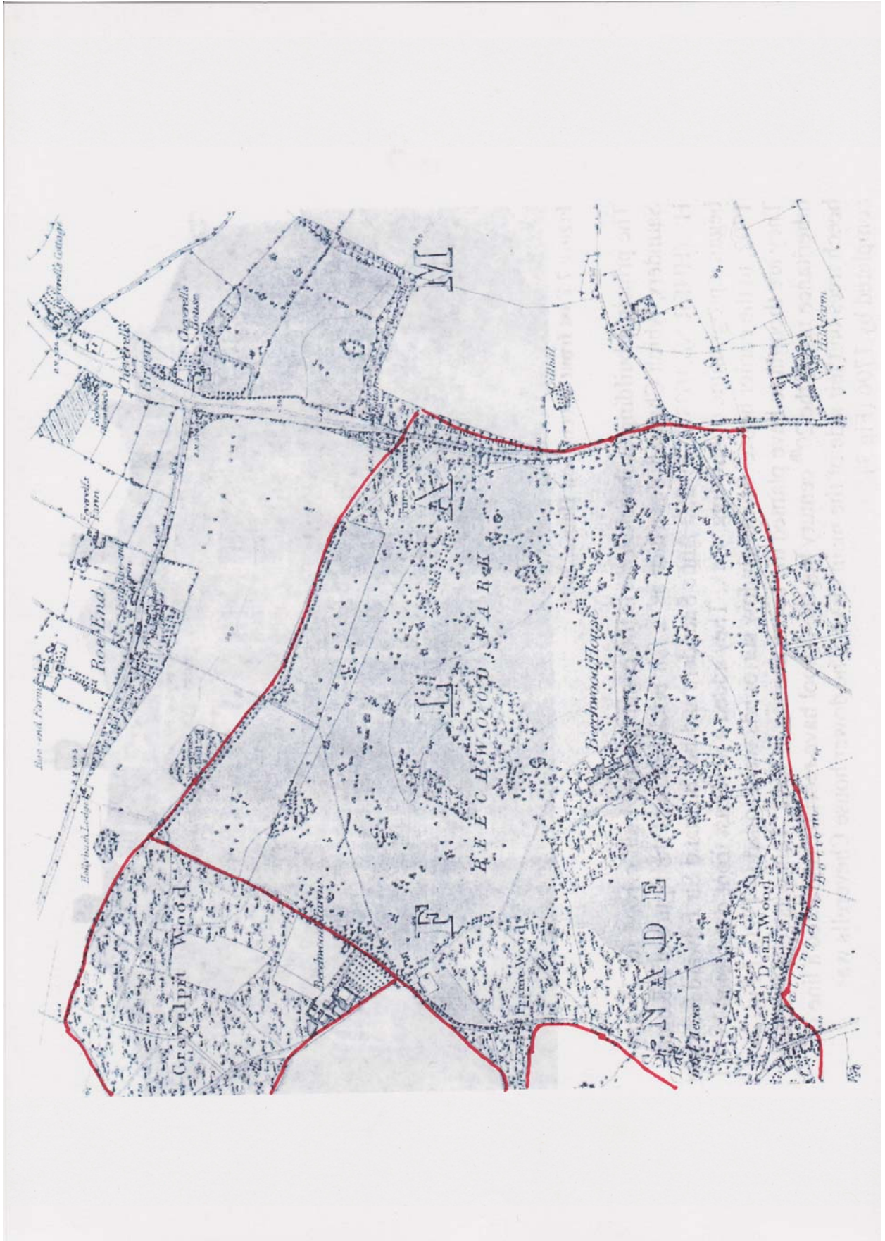
Ordnance Survey 1st Edition Sheet XXVI, 1883/4 Scale 6": 1 mile