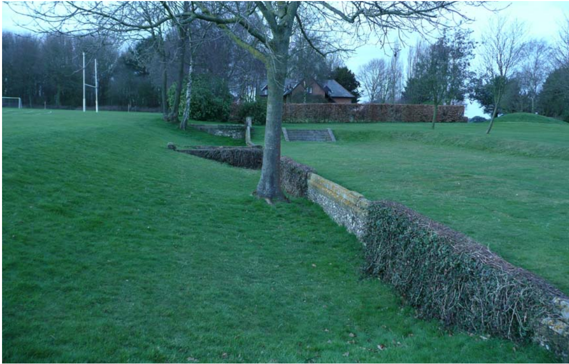
A surviving portion of the ha-ha and nineteenth century steps in the background