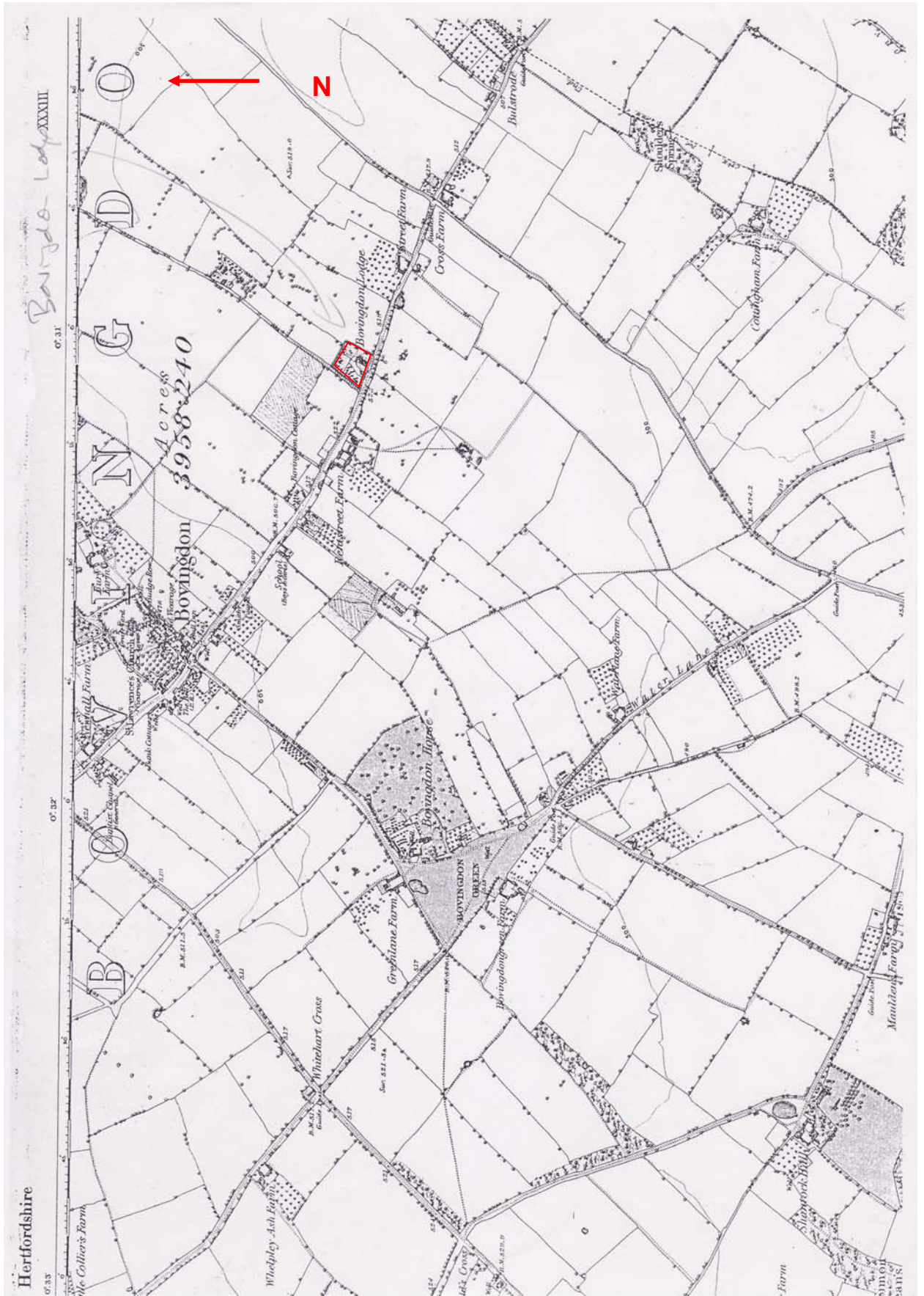
Ordnance Survey First Edition, 1873 Sheet XXXIII Scale: 6" to 1 mile