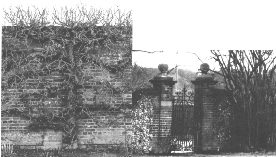
Walled garden at Gaddesden Hoo showing espaliered fruit tree and ornamental gateway