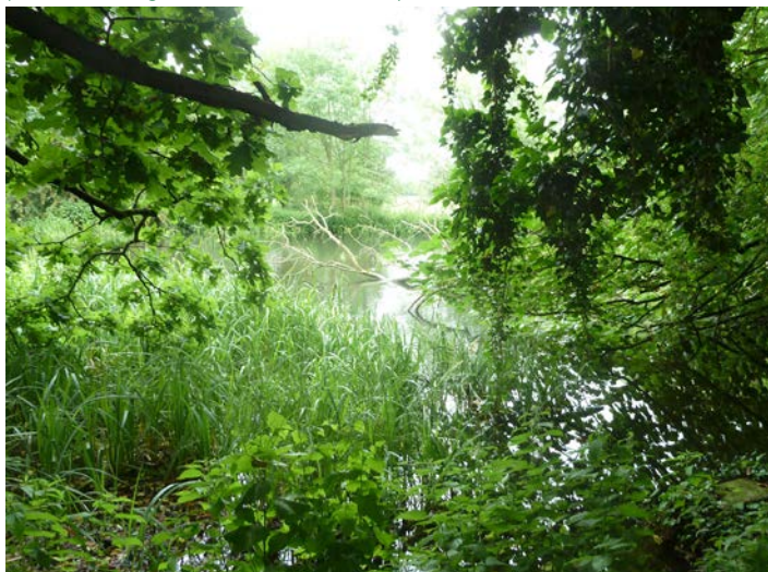
Pishiobury Park (Hertfordshire, IL) A public park where the Brown lake is very overgrown. (Kate Harwood)