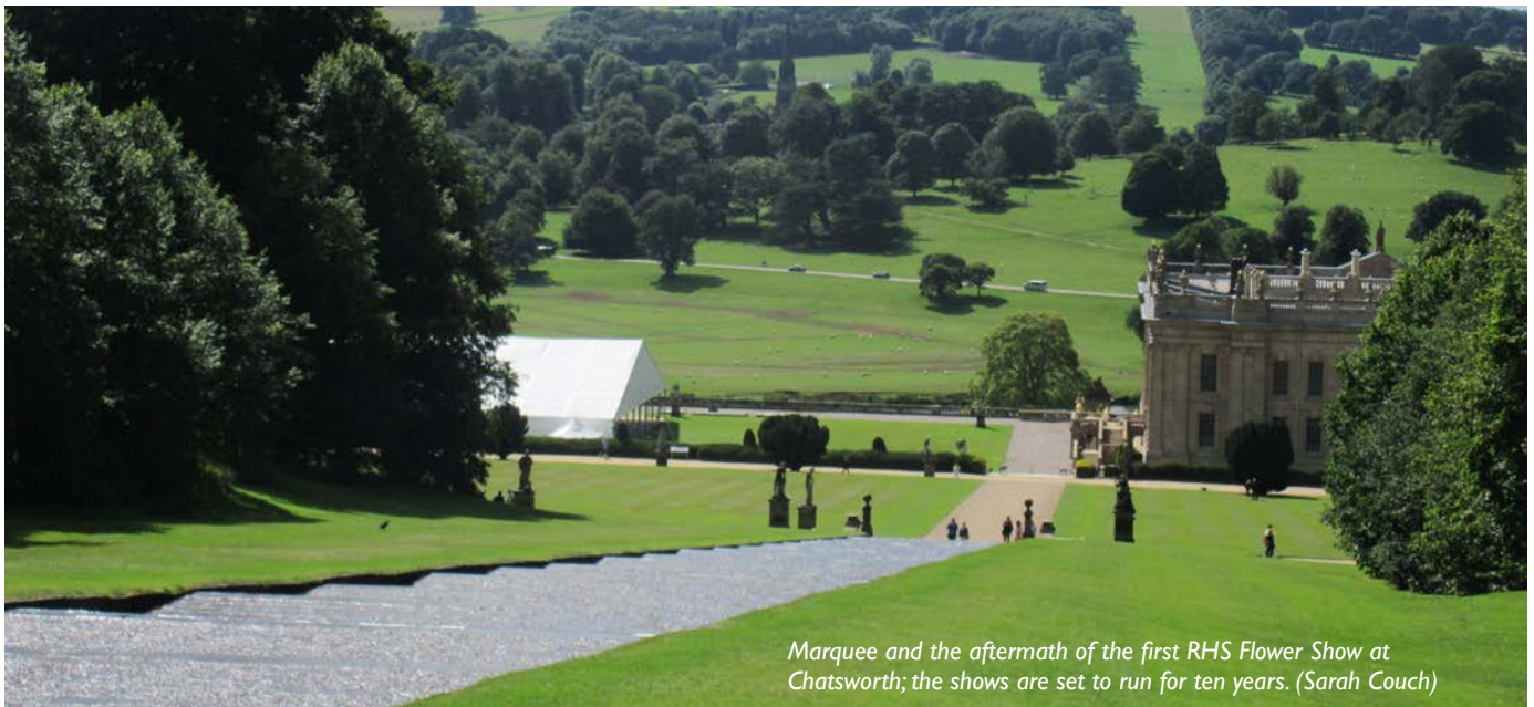
Marquee and the aftermath of the first RHS Flower Show at Chatsworth; the shows are set to run for ten years. (Sarah Couch)

Temporary events seem an easy financial win for owners as they struggle to keep Brown's parks afloat. However, the indirect cost comes from the effect of large numbers of visitors, cars, coaches and catering, causing long-term damage to the fabric and aesthetics of the 'soft' landscape ranging from compaction and damage to trees and archaeology to near-permanent marquees: not all the damage is reversible.