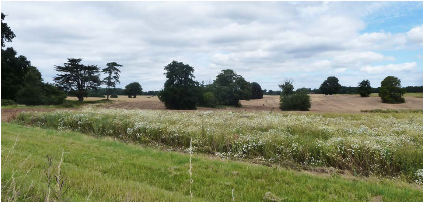
Arable fields on former parkland at Beechwood (Hertfordshire, unregistered). Changing land use can have a major impact on a park's character. (Kate Harwood)

Some of the vital features of a Brown landscape, such as its views, disposition of planting and grazed pasture, as well as setting, may not be covered by development control