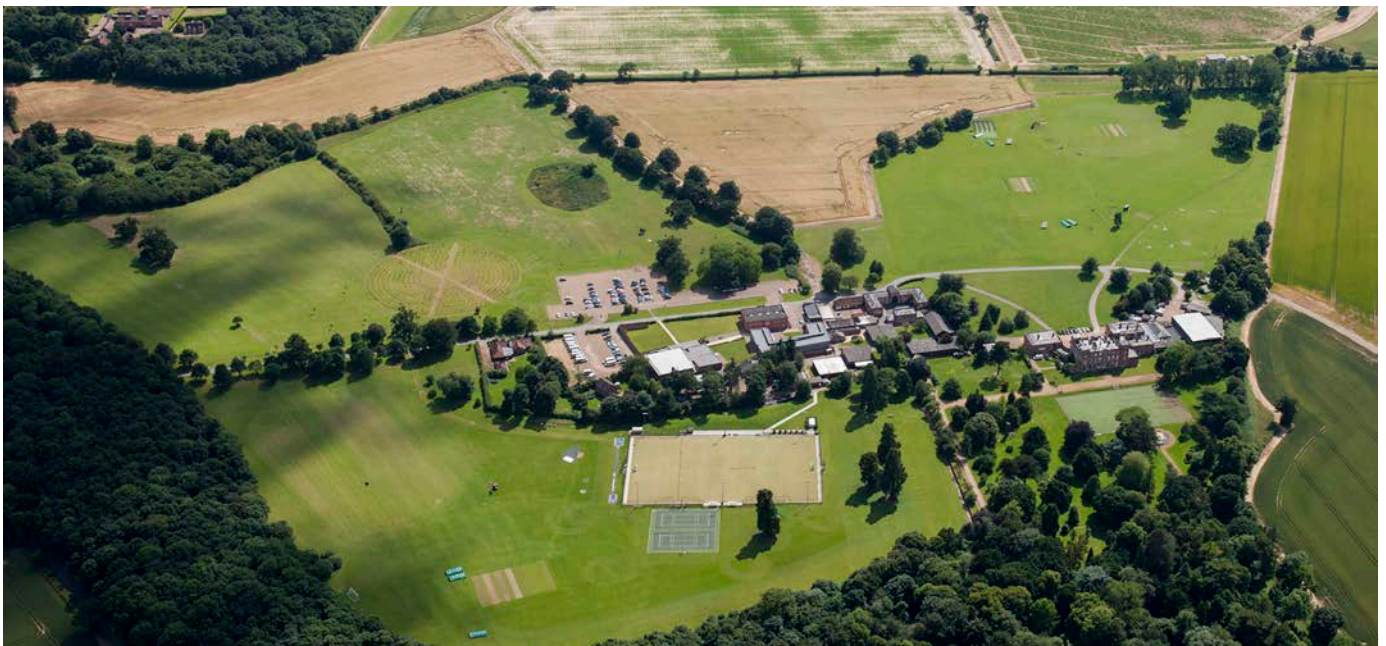
An accretion of school buildings, sports facilities and arable fields detract from the character of Langley Park, Norfolk. In 2009 the Garden History Society wrote of their regret 'that there has been ad hoc and detrimental development at Langley School over the years, leading to a significant degradation of its important historic landscape asset.'

Institutions require the flexibility to respond to ever-changing demands within tight budgets, making it hard to follow a long term masterplan. If heritage is not their core purpose it is relegated as a priority. The incremental impact of frequent and often large-scale change associated with institutions, especially educational and medical, can be severe. The landscape is commonly seen as a sacrificial element in achieving the core goals of the institution when it requires new infrastructure, and in preserving the listed historic buildings, which form a perpetual drain on resources. Educational bodies often need to upgrade facilities, enlarge campuses and car parking, and provide new accommodation. The attrition rate is high, with a constant stream of applications that builds into major damage to Brown's work.