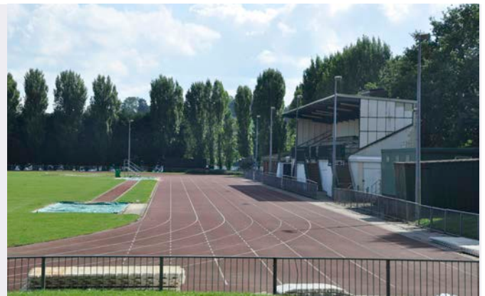
Wimbledon Park (London, II*) is in divided ownership with no agreed site wide masterplan to protect the heritage. It has become dominated by sports facilities and is under constant pressure. The athletics track and poplars obscure the lake. It is on the Historic England Heritage at Risk Register. (J&L Gibbons)