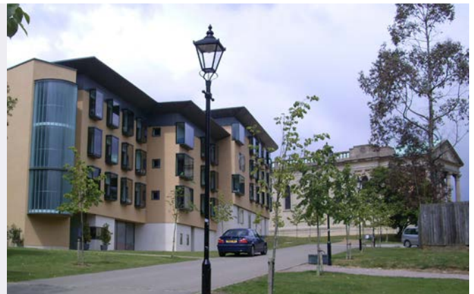
Left: multiple buildings in the divided park at Fawley Court, (Bucks, II*) on the Heritage at Risk Register and in divided ownership. Right: new school building visible from the Temple of Venus at Stowe (Bucks, Grade I) (Sarah Rutherford)