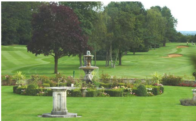
Fairway in main vista near the house at Moor Park (Hertfordshire, II*). The great extent of the golf course and associated non-Brown planting and parking are shown on the cover photograph. In 2017 there was an application for yet more parking.

The decision notice stated: It is considered that, due to the inappropriate position and design, the proposal would result in an incongruous addition to Syon Park which would fail to preserve or enhance both the setting and the special architectural and historic character of the Grade I Listed Syon House and the Grade I Registered Park and Garden ... and it is considered that, due to the extent of development already in situ which contributes towards the restoration and maintenance of the heritage asset, the proposal is not appropriate enabling development to secure the future of the heritage asset'.