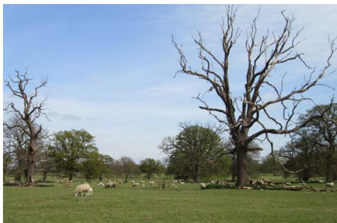
Brown's park trees are under threat from age, neglect, climate change and disease

The layout and landscaping of a park are not fully covered by designations and controls. Small buildings, fences, hedges, ad hoc and inappropriate planting, hardstanding, lighting and paving surfaces and agricultural changes are often permitted development outside planning control. Intrusive noise both on site and beyond, such as increased traffic, can undermine a site's character and natural qualities. There is no protection against loss from natural causes, such as loss of historic or ancient trees to age or disease or lack of management. Simple neglect or apparently minor changes in management cause great damage to Brown's designs. These include changing grazed pasture to arable, over-use of fertiliser and pesticides, over-grazing, re-wilding, not re-planting trees, lakes silting up, banks becoming overgrown and gradual obscuring of the historic design, particularly designed views.