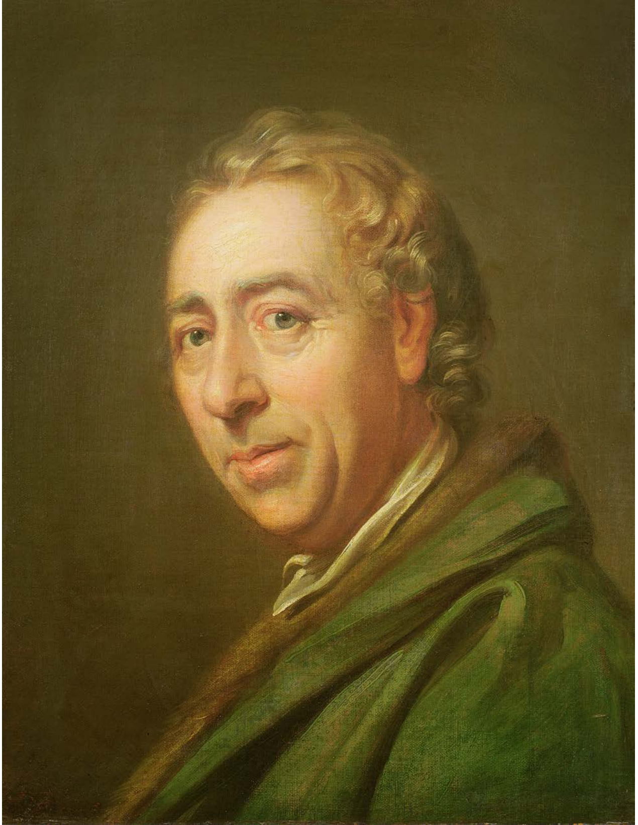
Portrait of Lancelot 'Capability' Brown, c. 1770-75, Cosway, Richard (1742-1821)

Cover image: aerial photograph of Moor Park, Hertfordshire, showing the impact of golf courses and parking on the Brown landscape.