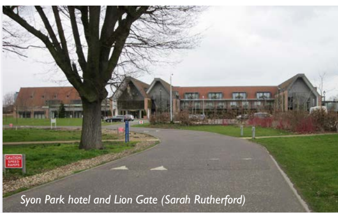
Syon Park hotel and Lion Gate