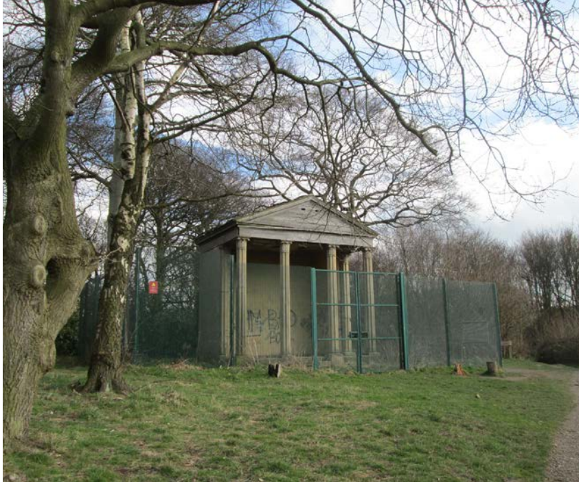
The derelict temple in the public park at Temple Newsam (Yorkshire, II) (Sarah Rutherford)

Rear cover image: aerial photograph of Aynhoe Park (Northamptonshire, Grade II)