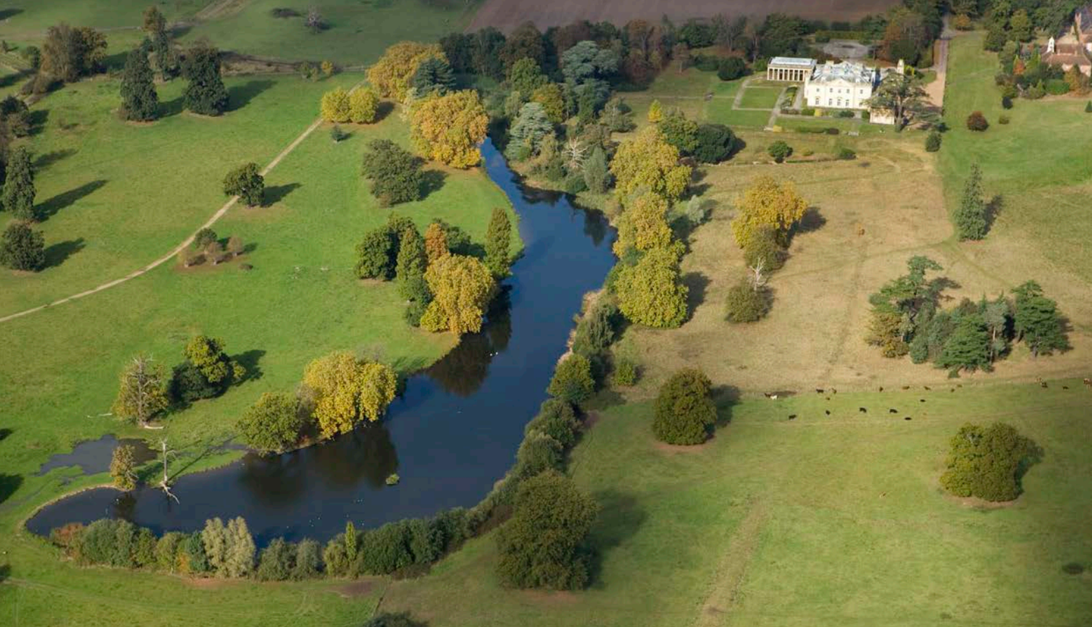
Langley Park (Buckinghamshire, IL): a country park restored with the help of the Heritage Lottery Fund.